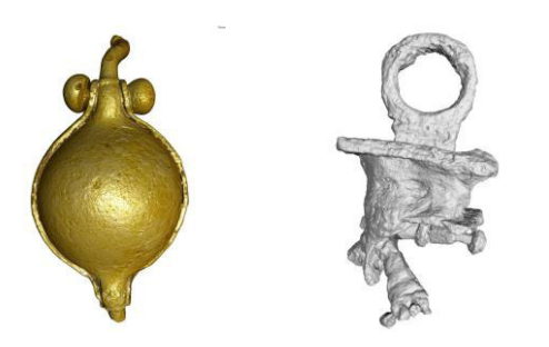
The bracelet (left) and the sanitary tool (right) from the necropolis "A la montagne"

This presentation describes the investigation of two objects from a necropolis (Nécropole à la Montagne) in Avenches (VD, Switzerland): a bracelet and a sanitary tool made of copper alloy and presenting different questions. In both cases it was necessary to get sight of the interior of the objects. For that purpose, completely non-destructively methods were needed. Although methods with X-rays are very common and easily available, they often fail when larger amounts of metals are involved. In such cases, neutron imaging methods can be very useful since the penetration of neutrons through metals is much higher and clear information about the inner content and structure of inspected objects can be obtained. In the same way, the state of preservation of the metal can be studied very carefully due to the high sensitivity of neutrons for hydrogen, a component in the corrosion products. Therefore, both objects were analysed by neutron imaging and X-rays with the facility NEUTRA at the Swiss spallation neutron source of the Paul Scherrer Institut. Energy-dispersive X-ray spectroscopy (SEM-EDS) was done at the University of Fribourg, Department of Geosciences. In addition, a non-metallic part of one object was studied by Raman-spectroscopy at the School of Engineering and Architecture of Fribourg. Based on these analyses it becomes possible to describe these two objects in a broad manner and to understand its manufacturing method.